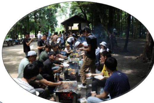
BBQ : Morinoizumi camp site