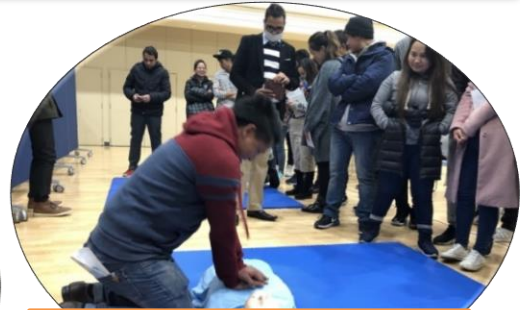
Disaster risk reduction center